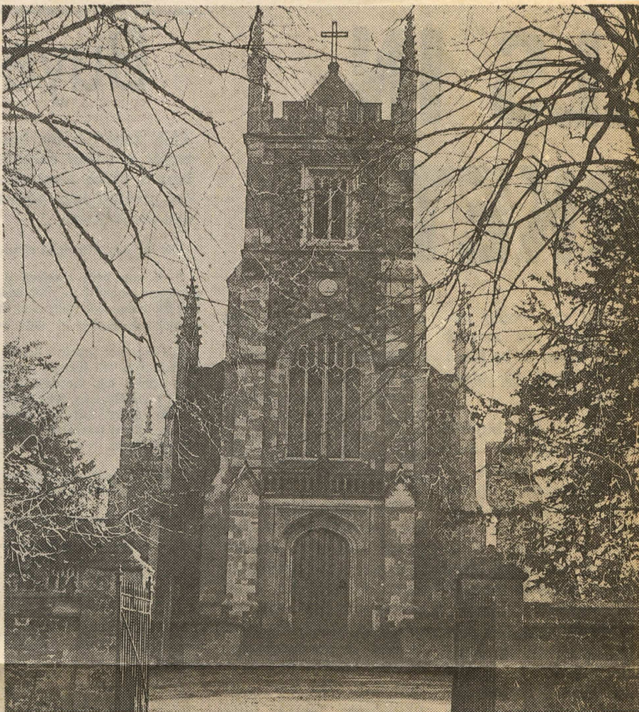
The front entrance of the "mothballed" Apostles' Chapel in Albury. It waits empty and silent for the Second Coming of the Lord.

Until that time, the chapel remains unused, a monument to the Catholic Apostolic Church which played an important, if transitory, part in the history of Albury.